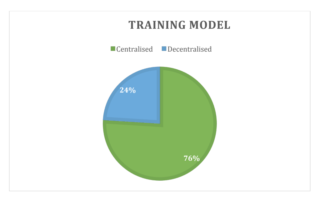
EUFJE Report on training and specialisation in environmental law Page | 20